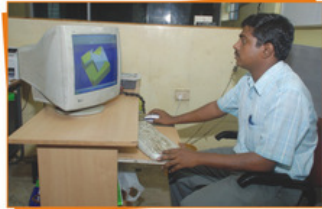
CAD Modelling & CAM Programing